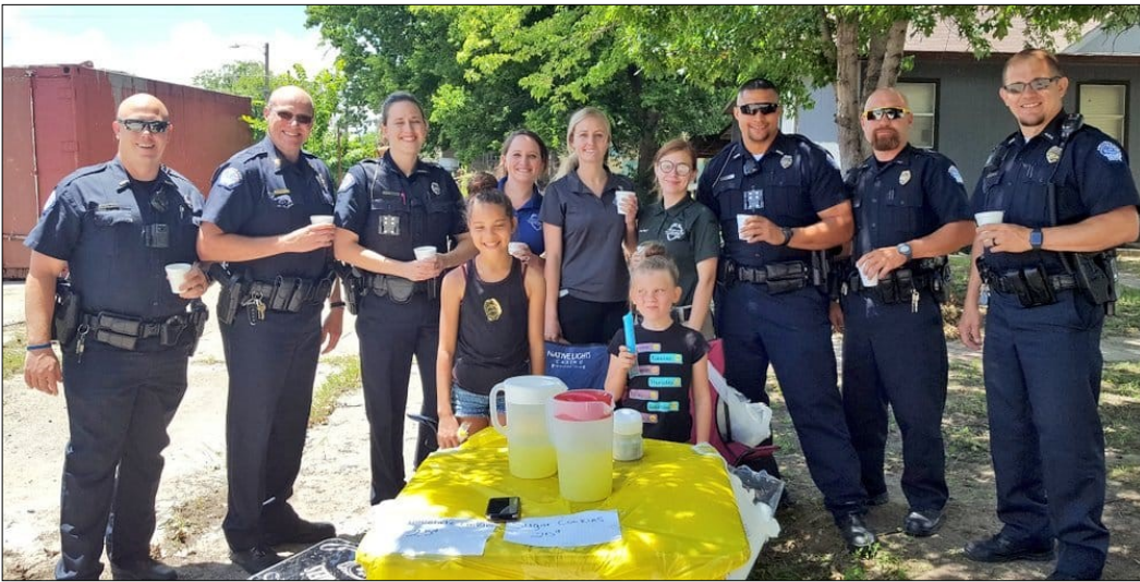
Connecting with the community, it's kind of our thing.